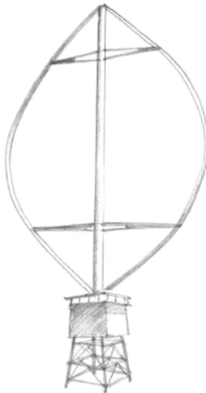
Figure 2 : Curved-bladed Darrieus VAWTs (M. Islam et al., 2008)