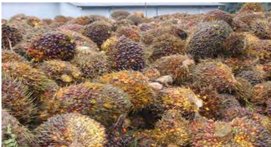
Figure 2.1: Fresh Fruit bunch before processing at palm oil mill

Palm oil mill extract the Crude palm Oil (CPO) and palm kernel from fresh fruit bunch using mechanical process. According to, (Praven Fatemeh Rupani, 2010) several units of operations are involved in order to extracted palm oil mill after the fresh fruit bunches (FFB) are transported to the palm oil mills. Figure 2.1 show the fresh fruit bunch in loading ramp before processing.