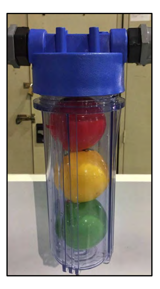
Figure 1.1: Ball bladder accumulator.

Figure 1.1 shows the ball bladder accumulator that will be used in this project. Suitable accumulator is needed for domestic usage to prevent this problem. In order to have suitable accumulator, one of the factors that should be aware of is the size of ball bladder inside the accumulator. The ball bladder is needed to absorb the shock wave. Thus, the size of it must be accounted to have a suitable accumulator for domestic usage. Therefore, this master project is focused on study effect of ball bladder size on hydraulic shock during the water hammer for domestic water system. Then, the effect of the ball bladder size of water hammer will be analysis to study the behaviour of it.