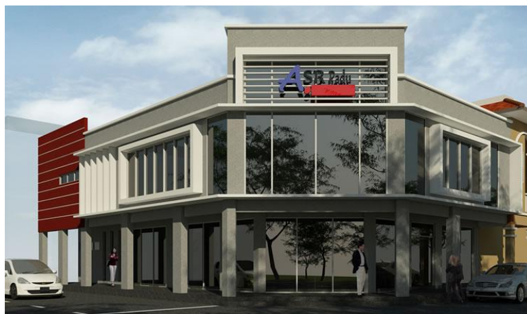
Fig. 1 Exterior of ASR Padu Sdn. Bhd

The office building was proposed for refurbishment and upgrade GBI certification which comprises new façade on its current building. Refurbishment of the shop house interior and exterior includes replacement of glazing and remodeling of some areas in the shop interior. Figure 1 shows the illustration of exterior of ASR Padu Sdn. Bhd.