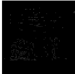
Fig. 5. An enhance absolute difference between the original image and the watermarked image