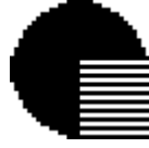
Fig. 4. Original watermark image consists of 32×32 pixels

The edge of a host image is computed using Canny edge detection to determine the edge location [11]. A sample Lena image is divided into blocks, each block consists of 8×8 image pixels. The host image is embedded a one-bit watermark for each edge image. The Random Numbers Generator (RNG) is an important computation in term of embedding process to generate the random numbers based on a secret key. The secret key is employed to encrypt and decrypt the watermark during watermark insertion and extraction. This paper implements mersenne twister method to generate random numbers for the embedding watermark scheme.