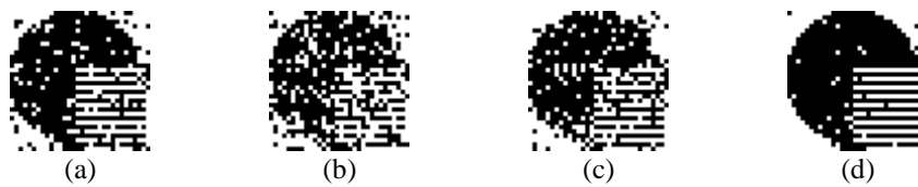
Fig. 7. The extracted watermark image after from (a) JPEG image compression, (b) Gaussian white noise 0.01, (c) Salt and pepper 0.02 and (d) 3×3 Gaussian low pass filter

Human visual system and its sensitivity are utilized in the design of this embedding watermarking scheme. The advantages of this watermarking scheme are the watermark image is perceptually invisible to the human eye and robust to non-malicious attacks. The destroying the image edge will remove the watermark. It also means that the quality of the host image will be damaged considerably.