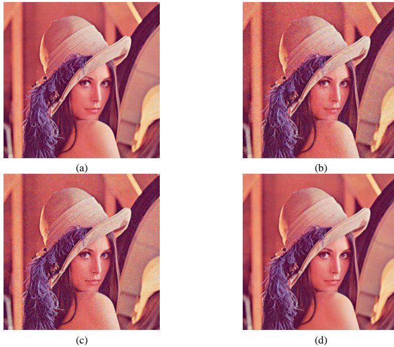
Fig. 6. The results of watermarked image from (a) JPEG image compression, (b) Gaussian white noise 0.01, (c) Salt and pepper 0.02 and (d) 3×3 Gaussian low pass filter