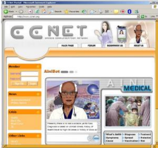
Figure 1: Natural language interface in CCNet Portal

AINI employs an Internet three-tier, thin-client architecture (Figure 2) that may be configured to work with any web application. Composed of a data server, application and client layers, this Internet specific architecture offers a flexible solution to the unique implementation requirements of the AINI system. The data server layer serves as storage for permanent data required by the system, where the knowledge bases (epidemic Domain-Specific extracted by the Automated Knowledge Extraction Agent (AKEA) [11] and Open-Domain from existing Artificial Intelligence Markup Language (AIML) Loebner prize knowledge base [12]) and the conversation logs reside. These web-enabled databases are accessible via the SQL query standard for database connectivity using MySQL database.