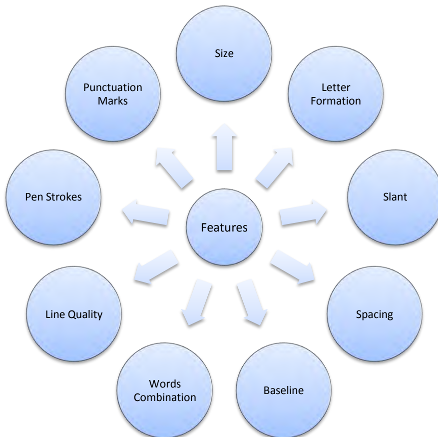
Figure 1.2: Handwriting Features

Handwriting is individualistic where every person has his/her own handwriting styles. All features from following criteria affect the individuality of handwriting which makes ones' handwriting differ from another: