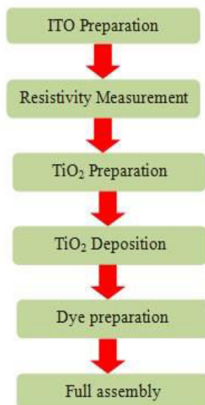
Figure-1. The fabrication steps of DSSC.

The fabrication process of Dye-sensitized solar cells involved different type of components in order to accomplish the whole assembly. The key point of DSSC mechanism included identifying the suitable indium tin oxide (ITO), preparation of \text{TiO}_2 paste, staining the organic dye and preparation of counter electrode (Ahmad et al. , 2010). Figure-1 below showed the fabrication steps in general.