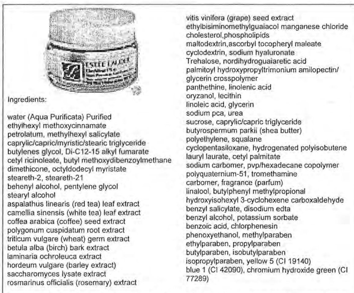
Figure 4 Illustration of an international brand, Estee Lauder DayWear Plus and the ingredients listed at the label.

Malaysian cosmetic firms adopt almost the same strategy in promoting and marketing their facial care product as seen in most magazine advertisement. Most of them do not give details on their formulation