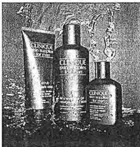
Figure 2 Men's skin care product by Clinique.

Almost everyone used at least one skin care products daily since the appearance and health of the skin has become a great concern. If we visit the skin care counter today, there is a vast array of lotions, potions and pots of magic creams designed to solve any number of problems, from dry skin to wrinkle. But do they work or not will depend on the material and the formulation used. Whatever the function of the cosmetic product, there is a limited list of ingredients that can be used. The selected ingredients in the calculated amount were mixed together as one formulation to make up a product that could deliver the desired effect. Growing awareness among public on the ingredient used force the cosmetics companies to be selective and consider the safety of the material used in their formulation. It is therefore, a compulsory for manufacturer to list the ingredient used at the product label.