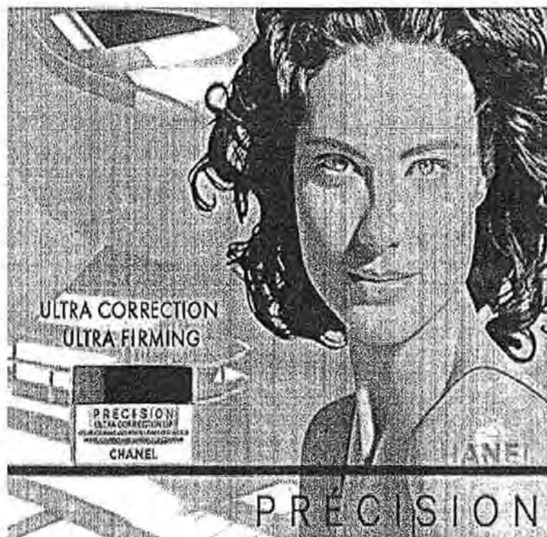
Figure 1 Advertisement of skin care product by channel

The word 'cosmetic' may give a picture of an attractive women with juicy colour lipstick, smooth and radiance skin and perfected with a wonderful smell of perfume, or a picture of ageing women who wonder if there is anything that can be done to slow the process of ageing and wrinkle skin. Although cosmetic are synonyms with women as always been portrayed in an advertisement as in Figure 1, men cannot simply be excluded in the cosmetic market. Recently, it is common for men to use cosmetic and this contributes to the sale of cosmetics products. Figure 2 shows an example of men skin care product.