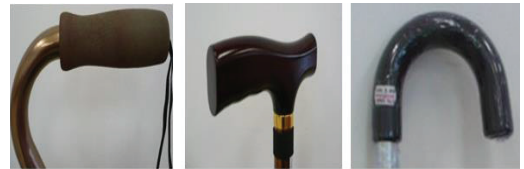
Fig. 3. Handle A (left), handle B (middle) and handle C (right)

(length =13.6cm, diameter = 3.4cm); Handle B (length = 14cm, major diameter = 3.8cm, minor diameter = 2.6cm); Handle C (length = 13cm, diameter = 3.2cm). As shown in Fig. 3, these three walking sticks are the most preferred by the elderly people in Malaysia.