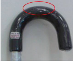
Fig. 4. Handle C. The contact point is concentrated on the top side

characteristic, handle A has more advantages compared to handle B and C. It has a straight and circular shape which is easier to grip and the subjects can grip it without creating a huge gap between the palmar side and the handle surface. As for handle C, although it has a circular diameter the curve-shape does not provide a large contact area because the contact point is concentrated on the top side of the handle (Fig. 4).