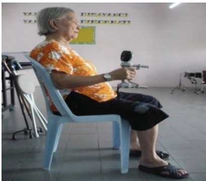
Fig. 2. Subject performing hand grip strength

The subjects were given one minute rest period between each squeeze. The second handle position of the Jamar hand dynamometer was used as the grip span setting in the measurement.