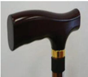
Fig. 5. Handle B - curvature shape

The handle B was rectangular curve (Fig. 5). Although it looks like having an ergonomic design and aesthetic value, however, the curvy top surface did not contribute to a large contact area for gripping the handle. Palm and finger sizes of each subject were different thus not all hands can fit this handle design. It creates a huge gap between the palmar side and the handle surface which resulted in less contact area. An established study pointed out that the handle curvature interferes the interaction between the user's hand and the stick in terms of contact area and pressure concentration. This can affect individual comfort [26].