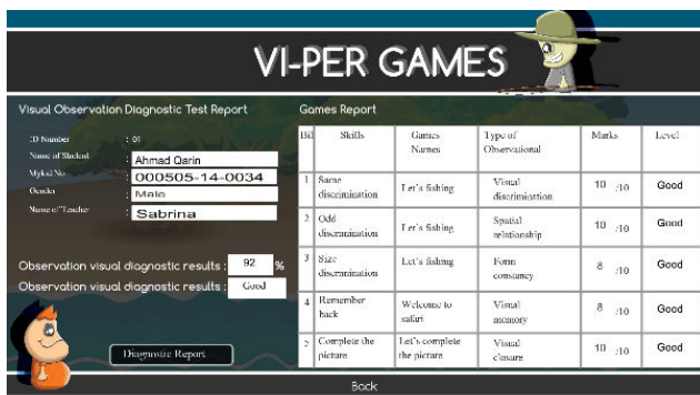
Figure-2. Vi-Per Games Student Information Interface.

Figure-2 shows Vi-Per Games Student Information Interface. It displays Visual Observation Diagnostic Test Report and Games Report. The report of the games will summarize the skills, games name, types of observational, marks and level that are scored by students.