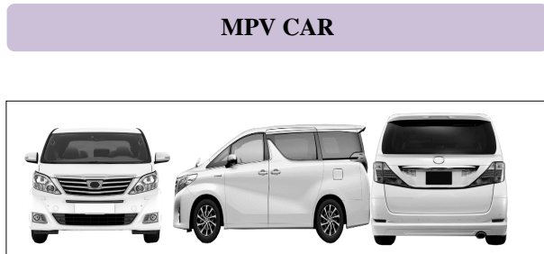
Figure 1: MPV car in the front, side and rear view were shown to respondent for each design

(Kansei) and Physiognomy characteristics. These correlations are to determine the strength of the assessment the variables 25 . To ensure that the statistical data acquired using the questionnaire in this study exhibited satisfactory reliability, a reliability analysis of the data was conducted to determine the Cronbach's \alpha value. Cronbach's \alpha of between 0.65 and 0.70 indicates moderate reliability, and that a Cronbach's \alpha of between 0.70 and 0.80 entails high reliability [26].