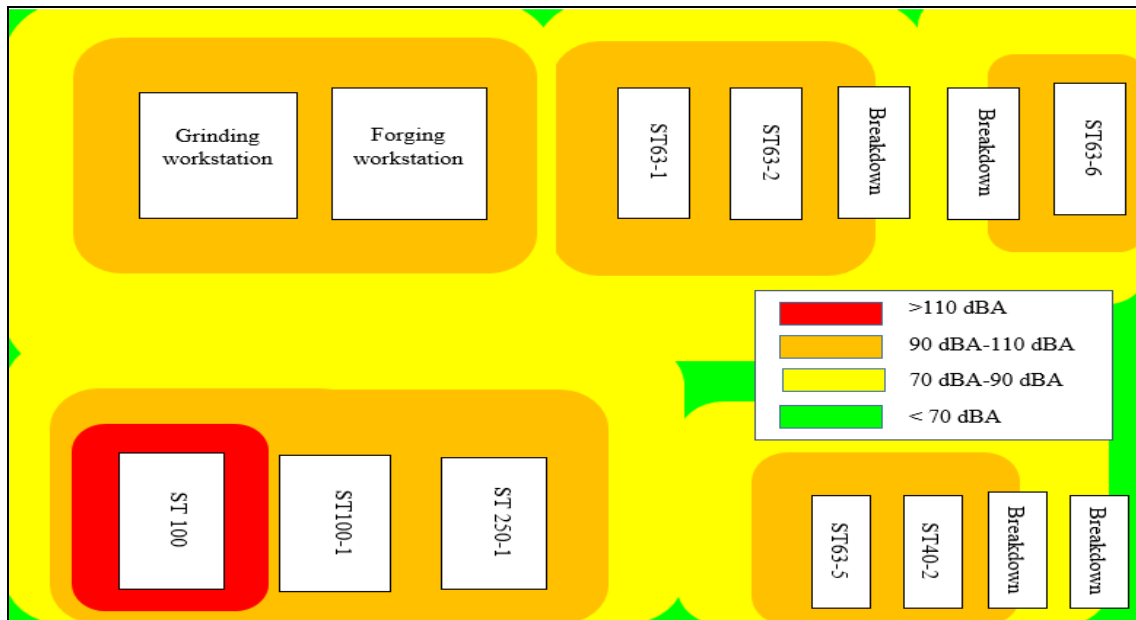
Fig. 2 - Noise map of metal stamping workstation