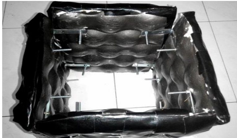
Fig. 3 - Prototype of noise insulator (Design B)

A noise insulator prototype was built from four 23 x 30 cm partitions with thickness of approximately 3 cm (Fig. 3). The partitions were made using the mixture of recycled papers, coconut fiber and tapioca flour mixture. Testing on the prototype showed a noise level reduction by 17.2 % could be deduced in the prototype testing with the reading decreased from 84.9 dBA to 70.3 dBA as depicted in Fig. 4. The testing result indicates promising results for actual implementation of design in the company though further testing is recommended. Optimization of the design could increase performance of the noise insulator. Thicker wall could improve the design based on better sound absorption of coconut fiber layer wall from previous studies at 5 cm and 10 cm [23].