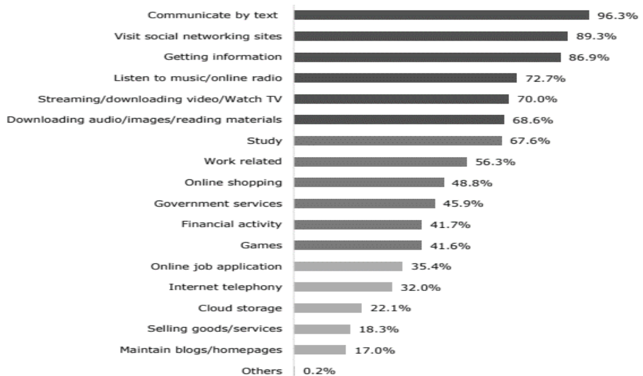
Figure 3 : Percentage of internet users by online activities

participate in online purchasing activities (Meskaran et al, 2013) and reasons why consumers do not engage in e-commerce (Lee and Turban, 2001). It is proven by MCMC (2017), where the report shows that there are only 48.8% who does online shopping (refer figure 3). Although online advertising has become a trend nowadays, some people experience a lack of trust towards online transaction. There is a need to investigate this issue as well, because without a clear understanding of consumer behavior, it would be difficult to devise effective marketing and sales strategies and even business models (Nejati et al. 2011). Hew (2017) revealed that most Malaysians do not trust the information from the internet, and only 17% of consumers trust the information from internet especially social media.