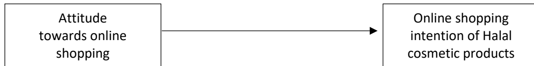
Figure 1. Framework

H1: consumer attitude towards online has a positive effect on online shopping intention of Halal cosmetic products.