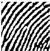
Fig. 6. Fingerprint images after crop to the 25mm 2 square size