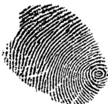
Fig. 2. Binarization