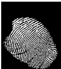
Fig. 3. Complement the image