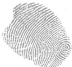
Fig. 1. Normalization

The size of pixel use in the calculation after the conversion process is 118 pixels per 5 mm. The process of developing this algorithm is involved in two phases which are Image Pre-processing and Feature Extraction. Image preprocessing focused on removing the unimportant data information of the fingerprint images. The preprocessing is implemented to get the separated of ridges and valleys image. In this study, the image is processed using normalization, binarization, complement image, and filtering image in order to get a high quality fingerprint image.