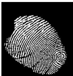
Fig. 4. Filtering Image

For feature extraction, the calculation of Ridge Density is done by calculating the connected black and white line. The process of translating the forensic manual method to the proposed algorithm is shown in Table I.