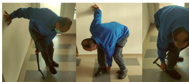
Figure 2: A user has difficulty stabilizing his posture while donning a lower limb exoskeleton

The overall energy used by the body to carry out physical actions like walking and industrial job processes is