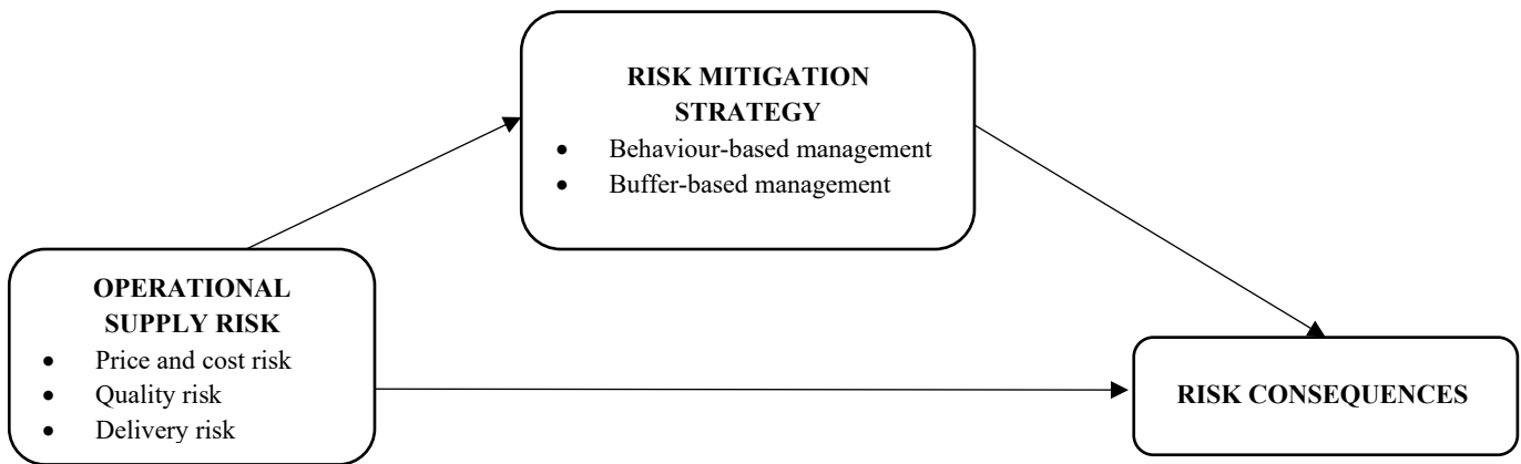
Fig. 1. Proposed research model of operational supply risks management for halal food manufacturers

The study proposes a research model to examine the relationships between OSR, RMS, and RC, with the mediating effects of RMS. Based on these relationships, the study formulates 15 hypotheses that aim to make the supply chain more resilient by mitigating risky events. Fig. 1 illustrates the proposed research model of operational supply risk management for halal food manufacturers.