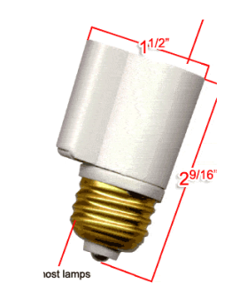
Figure 2: Socket Lamp Module

requires transceiver to be always in on condition and always get power supplied by the grid power. Plus, this product works dependently with the on-grid power which it unable to operate if there is a blackout situation happened. Moreover, the product controls the car porch lights by the use of handy remote control which uses human power. It seems to be difficult to switch on the lights when the owner is located more than 100 feet away from the house. During night, it cannot automatically switch on the house car porch lights. Unlike the off-grid system for house car porch lighting which operates independently by the use of an off-grid system which uses PV system to automatically switch on the car porch light once the surrounding place getting dark.