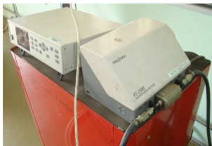
Figure 9 – Ono Sokki fuel consumption meter