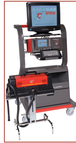
Figure 4 - Stargas 898 OBD scanner and gas analyzer

Looking at the capabilities of these two laboratories in UTeM, the potential research work to be explored in automotive industries is endless. In addition to fundamental combustion works, engine management system (EMS) development has become one of the important areas to be investigated by UTeM researchers. Some early works in EMS have begun in UTHM and UMP, and UTeM will enter this joint effort to further contribute to the automotive development in Malaysia. The centre also carried out evaluation and assessment on technologies for fuel economy and performance improvement.