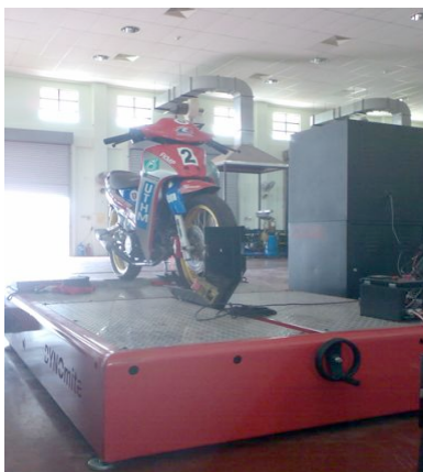
Figure 7 – Dynapack chassis dynamometer