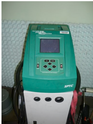
Figure 8 – AUTOCheck Analyser