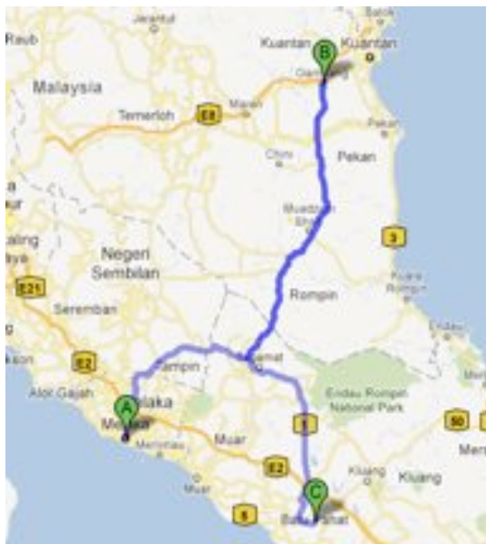
Figure 1 – Locations of UTeM, UMP and UTHM

Figure 1 shows the locations of the universities – (A) Universiti Teknikal Melaka, Melaka; (B) Universiti Malaysia Pahang, Gambang, Pahang and (C) Universiti Tun Hussein Onn Malaysia, Parit Raja, Batu Pahat, Johor. Those universities are located in the southern Peninsular of Malaysia and are easily accessible via the main highways. In Pahang, UMP is very close to the Pekan automotive key player, DRB-HICOM. Meanwhile UTeM in Melaka is near to local HONDA assembly plant and vendors. UTHM, the furthest south, although not close to major automotive manufacturers/assemblers, it is nearby to local assembler Oriental Assemblers Sdn Bhd. Apart from the automotive related industries, these universities are within reach to other kind of industries – processing (oil, chemical, biodiesel), manufacturing and production.