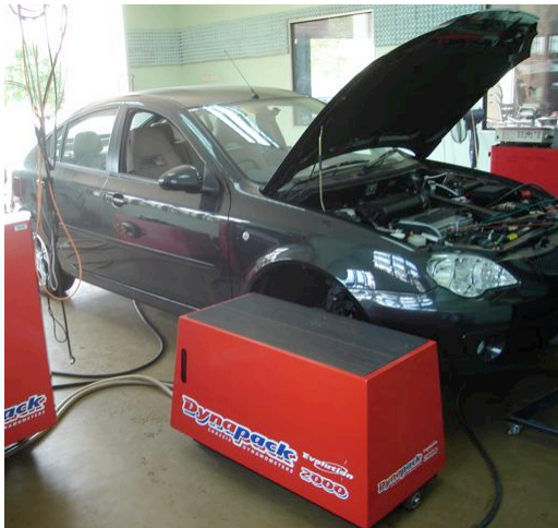
Figure 6 – Dynapack chassis dynamometer