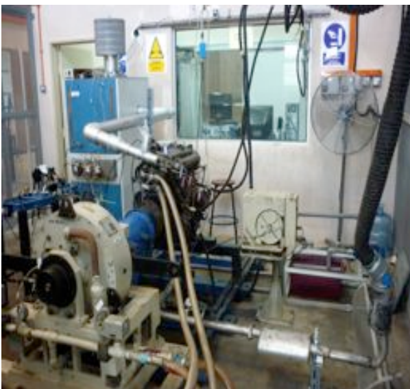
Figure 5 - Engine test cell layout in UMP

An exhaust gas analyzer KANE systems complete with a 3-meter long sampling probe is used for emissions measurements. The sampling probes of smoke meter and gas analyzer are mounted centrally at the end of the engine exhaust pipe.