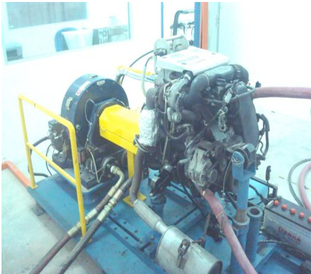
Figure 2 - Diesel engine on MD-DGEC150 Dynamometer