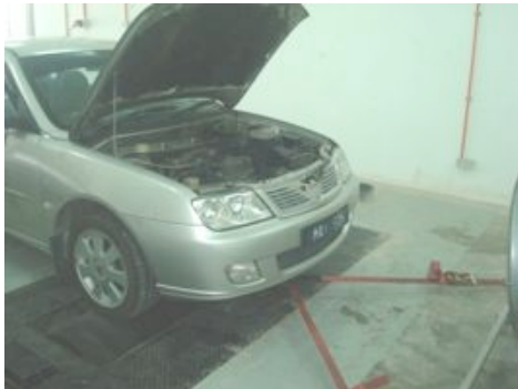
Figure 3 - DynoJet 224xLC Chassis Dynamometer testing a Proton Waja