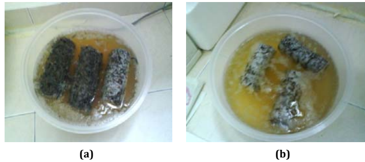
Figure 3: (a) briquette with ratio S/N 1, S/N 2 and S/N 3 and (b) briquette with ratio S/N 4, S/N 5 and S/N 6.

hours to observe whether the briquettes will disintegrate in water during the period of time. As a result, none of the briquettes disintegrated in the water after they are immersed for 24 hours. The figure of briquettes after 24 hours of water immersed is presented in Figure 3.