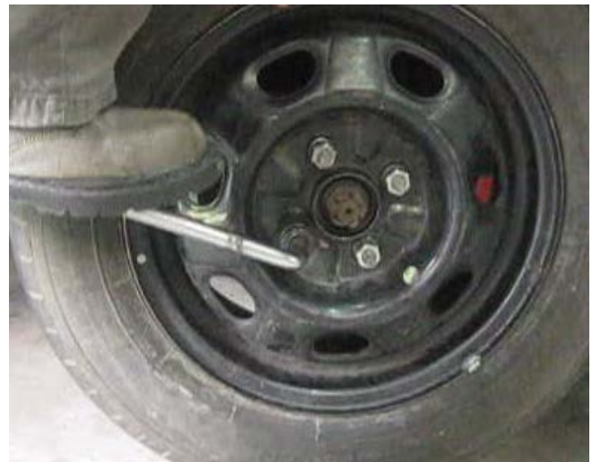
Fig. 9. Removing one wheel nut using L-shaped wrench.

Experiments are conducted on the wheel of Proton Wira 1.5 car. An impact wrench is used with the support of 5.5 hp air compressor. The time taken to remove all nuts is recorded. Fig. 9 shows the experiment of removing wheel nut using L-shaped wrench. Fig. 10 shows the application of VAWNR in removing all wheel nuts at once using lever. Impact wrench is used to remove the nut one by one (Fig. 11). Fig. 12 shows impact wrench is used with VAWNR to remove all wheel nuts. The time taken to remove wheel nuts using VAWNR and lever is almost the same as using L-shaped wrench. However, the torque applied is reduced 33%. Using VAWNR with impact wrench, removing four nuts at once is faster than removing one nut at a time. The reduction in time taken is about 53%. The data is tabulated in Table 2.