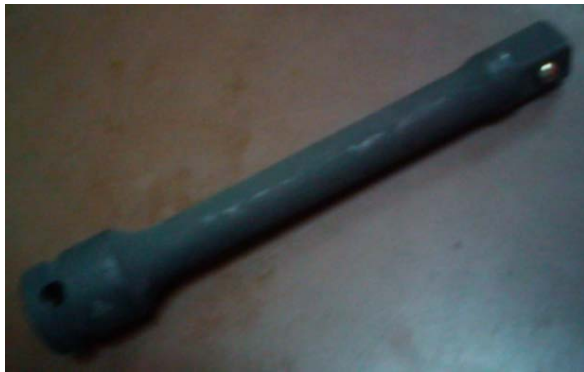
Fig. 5. Shaft.