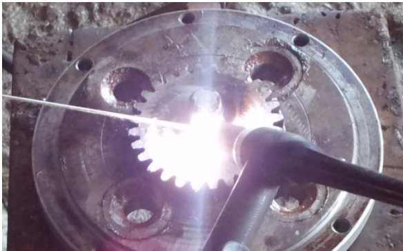
Fig. 6. Joint location for welding.