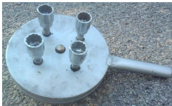
Fig. 8. Finish product.