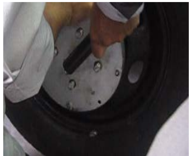
Fig. 10. Removing all wheel nuts using VAWNR and lever.