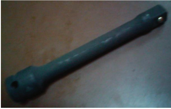
Fig. 5. Shaft.