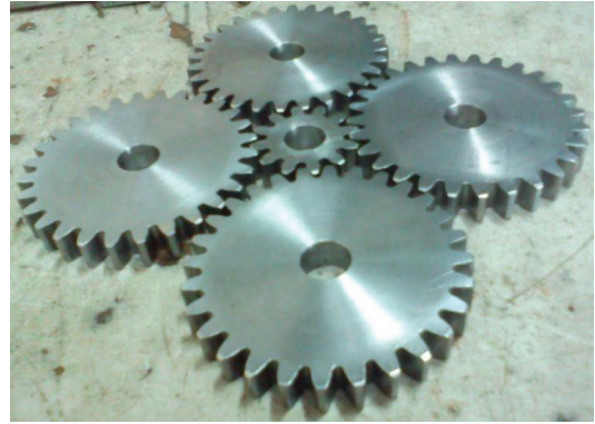
Fig. 3. Fabricated gears.

Fig. 3 shows the shape of the gears after milling process. The housings of the tool are made of low carbon steel (Fig. 4). A standard shaft for socket holder is cut and welded on the driven gears (Fig. 5 and 6). Grease is used to reduce wear, tear and heat of friction from mating gears (Fig. 7). Once the tool is assembled, a layer of paint is applied to finish the surface and protect from corrosion (Fig. 8).