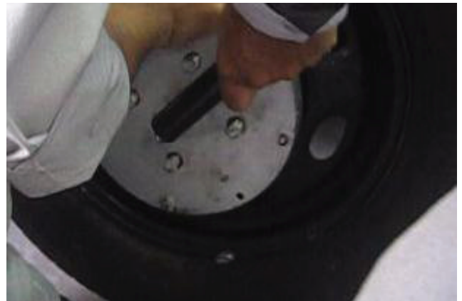
Fig. 10. Removing all wheel nuts using VAWNR and lever.