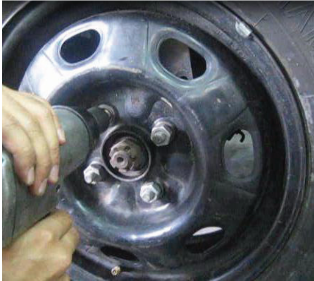
Fig. 11. Removing one wheel nut using impact wrench.