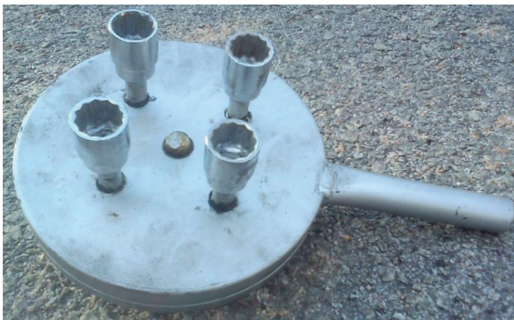
Fig. 8. Finish product.