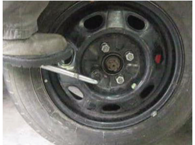
Fig. 9. Removing one wheel nut using L-shaped wrench.

Experiments are conducted on the wheel of Proton Wira 1.5 car. An impact wrench is used with the support of 5.5 hp air compressor. The time taken to remove all nuts is recorded. Fig. 9 shows the experiment of removing wheel nut using L-shaped wrench. Fig. 10 shows the application of VAWNR in removing all wheel nuts at once using lever. Impact wrench is used to remove the nut one by one (Fig. 11). Fig. 12 shows impact wrench is used with VAWNR to remove all wheel nuts. The time taken to remove wheel nuts using VAWNR and lever is almost the same as using L-shaped wrench. However, the torque applied is reduced 33%. Using VAWNR with impact wrench, removing four nuts at once is faster than removing one nut at a time. The reduction in time taken is about 53%. The data is tabulated in Table 2.