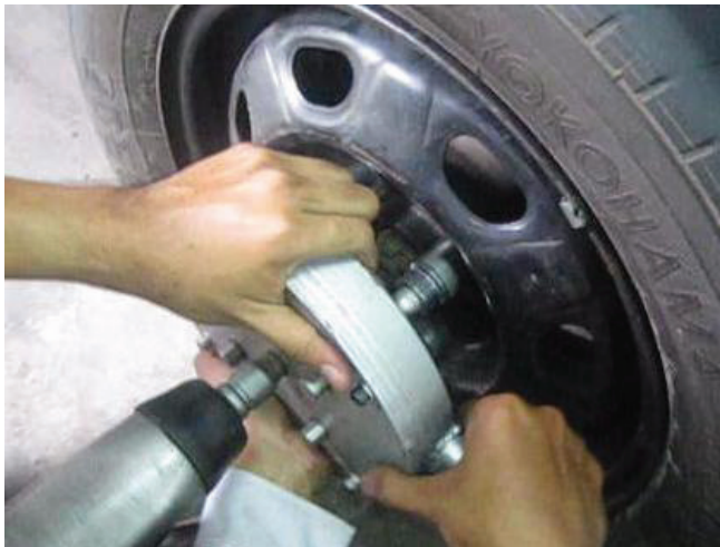
Fig. 12. Removing all wheel nuts using VAWNR and impact wrench.