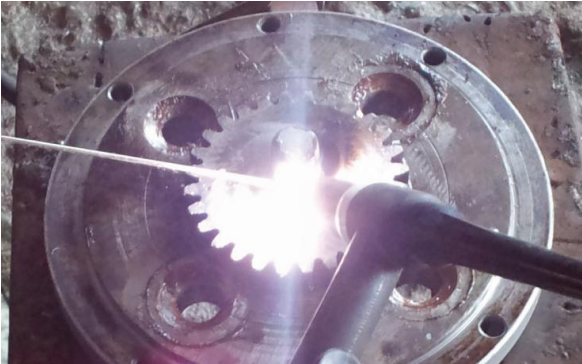
Fig. 6. Joint location for welding.