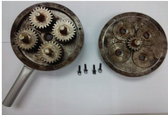
Fig. 7. Grease application.