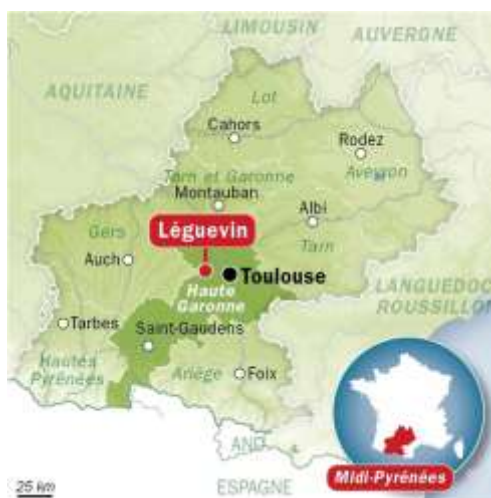
Figure 1 Léguevin location

Léguevin is a small village or municipality in the South-West of France, at the West of a Major aeronautical town Toulouse by 19 km, with population of about 8054 (estimation 2011) inhabitants. It belongs to the Haute Garonne department and Midi – Pyrénées Region. It takes part in a bigger structure called ‘Communauté des communes’ or Committee of municipalities, forming about 33000 inhabitants. By this way, it does not belong to Toulouse Agglomeration and it has the authority to take some decisions especially in the Development Durable issues. It is bordered from North to West by the Bouconne Forest and from South to West by four sides Highway. It has a mixture of population with most of them working in the Airbus industry. More than 53% of its lands is dedicated or reserved for the agricultural with a small number of industrial sites [1]. It is located beside the administration buildings (two sports halls, one theatre, two primary schools, two preprimary schools and three nurseries) and regional railway station at a distance of about 6 km at the nearest city Brax.