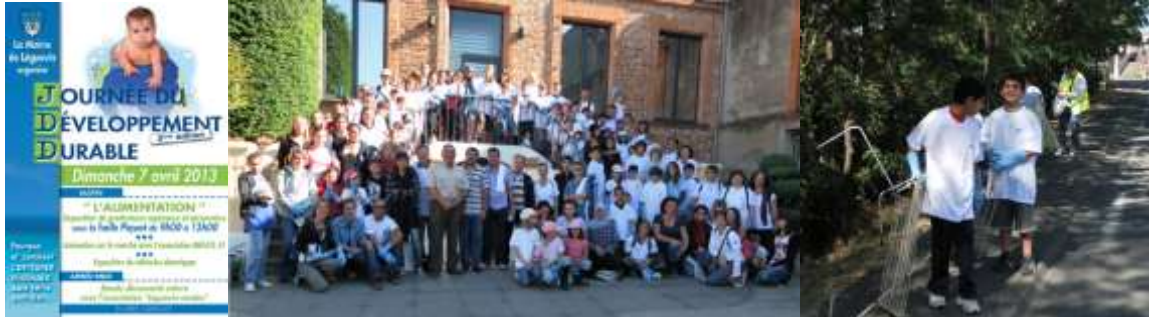
Figure 3 Examples of the actions for the sustainable development day activities.