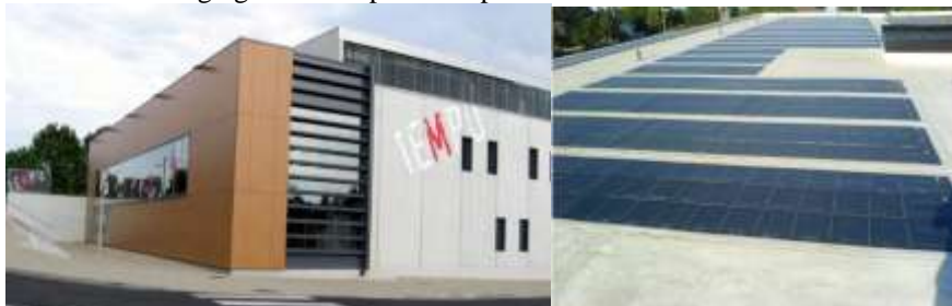
Figure 5 The municipal theatre 'TEMPO' with its roof covered with PV panels.